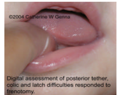
Types 3 and 4 may require a digital exam

Type 4 is most likely to cause difficulty with bolus handling and swallowing, resulting in more significant symptoms for mother and infant (see section on Diagnostic Assessment).