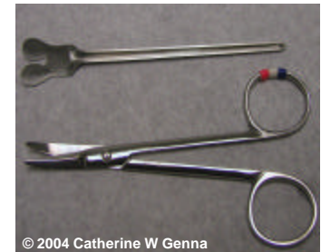
Grooved director and blunt Metzenbaum scissors.

IV. Head lamp or surgical focused floor lamp. If needed may use #7 magnifying opti-visor.